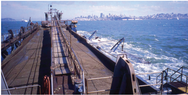
Sand mining dredge on the Bay.

Shifting Sand Math: Sediment transport and supply to the Bay came into the agency limelight again this January, when the Bay Conservation and Development Commission approved a new initiative to develop a regional sediment management strategy, partnering with sediment managers and scientists who work with flood channels, habitat restoration, watersheds, and aggregate mining. The meeting came on the heels of the State Lands Commission's re-issued November EIR on sand mining impacts, and a USGS study earlier in 2010—both of which contain complex technical computations that don't necessarily square up with each other in terms of assumptions about Bay sediment supplies and movements. MORE