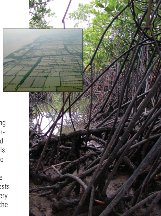
Natural mangrove forest. INSET: Mangrove deforestation.

Will carbon trading in wetlands happen soon? There are protocols for trees but they don't exist yet for wetlands. We're working on standards that would allow states, primarily California and west coast states, to trade through the climate action reserve. I can see this happening two to five years out.