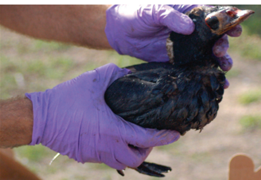
Oiled Scoter.

Four years after the Cosco Busan released 53,000 gallons of bunker fuel into San Francisco Bay, federal, state, and local agencies settled their suit against the vessel's owners and operators. The settlement package, a total of $44.4 million, contains dozens of proposals involving shoreline restoration and habitat enhancement for waterbirds and herring. Outlays for recreation ($18.8 million) and wildlife and habitat ($11.5 million) raised some eyebrows. The settlement's draft Damage Assessment and Restoration Plan (DARP) also illustrates the challenges of managing migratory bird populations. Although surf scoters suffered more from the spill than any other species, the plan's developers were unable to identify a project to build up their numbers; instead, the trustee agencies will invite proposals.