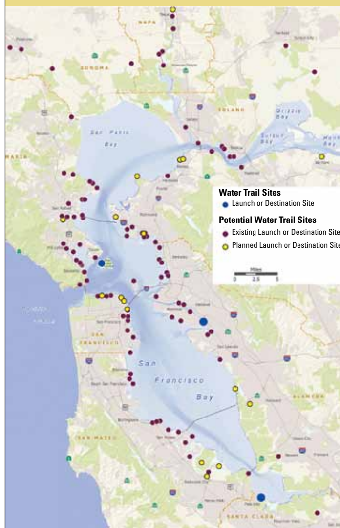
Map: courtesy of SCC