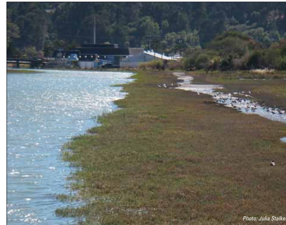
Mouth of Coyote Creek, Marin County