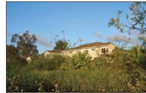
Cattails and willows like wet spots, such as this HOA owned property at Chelsea by the Bay on the San Pablo Bay shoreline. Wetlands and riparian areas, public or private, can not only provide natural beauty in an urban or suburban landscape, but can also benefit watershed health.

Other HOAs around the Bay Area likely face similar struggles. Perhaps these privately held pocket ponds, creek stretches and wetlands need a more public-spirited guardian, like a local land trust or the non-profit associations that help state parks. But nothing much seems to be on the horizon, and the habitat value of these isolated pockets, which are unlikely to have rare species or rich species assemblies, may be questionable in the big picture of regional habitat management.