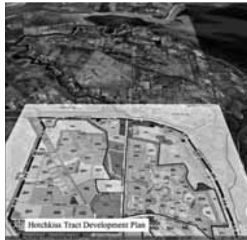
Bob Twiss and CALFED

A demand for more affordable housing in the Bay Area has cities like Oakley—with lots of empty land—itching to build, including 4,000 new homes on a 2,546-acre tract just outside its eastern border. Trouble is, this land, known as the Hotchkiss Tract, is located behind levees and six feet below sea level.